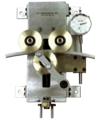
CAT. NO. DSBD1

Unit includes Dies for 3/16", 1/4", 5/16", 3/8", and 1/2" (4.8, 6.4, 7.9, 9.5, and 12.7 mm) standard height CRL, All Metal, and Nichols Homeshield Spacer profiles. NOTE: Will not work with Slim Line/Narrow profiles. Different widths, other Spacer brands, and all Slim Line Narrow profiles require custom Die Sets. These Custom Dies are manufactured to customer samples. Contact CRL Glass and Glazing Technical Sales for machine details and specifications. F.O.B. Los Angeles, California. Minimum order is one each.