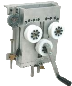
CAT. NO. MMBD1

The MMBD1 includes one set of Dies. If additional widths of muntins are going to need bending then an additional set of Dies will need to be ordered. If using Muntin Bars not sold by CRL then three each 36" (914 mm) samples of muntin must be sent to CRL. This is due to the tight machining tolerances needed to produce this precision piece of equipment. If you are using CRL brand Muntin Bar just specify the CRL catalog number that the Dies should be made to work with. Contact Glass and Glazing Technical Sales for machine details and specifications. F.O.B. Los Angeles, California. Minimum order is one each.